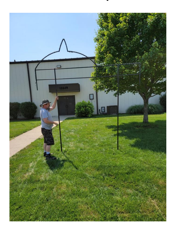
STEP 5: Raise each City Outline with 2 people (one on each side).

STEP 4: Find the 4 pieces of guide wire on each of the two pieces of the City Outline (this is the same as with the Angel Gabriel, Heavenly Host, etc. display pieces) Untangle them as you will be staking down both pieces after raising the two pieces of the City Outline.