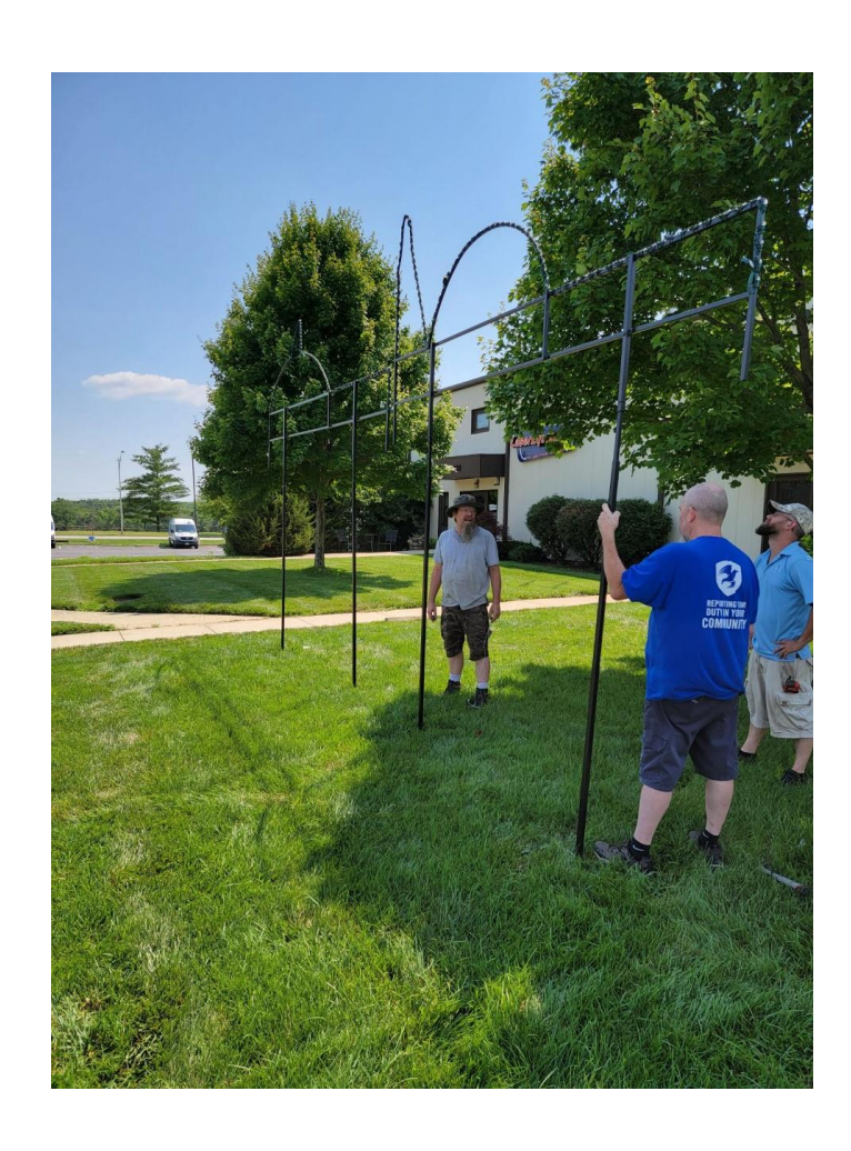
STEP 6: Stake down all 4 16' guide wires on each part of City Outline (total of 8 to stake down)